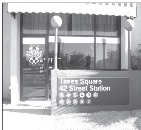
NYPD Pizza in Scottsdale offers East Coast fare at affordable prices.

It's an offer you can't refuse. NYPD Pizza offers traditional New York-style thin crust pizza at reasonable prices. If pizza isn't what you want, the menu includes soups, salads, calzones and sandwiches.